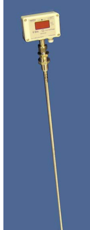
Liquid Level Sensor