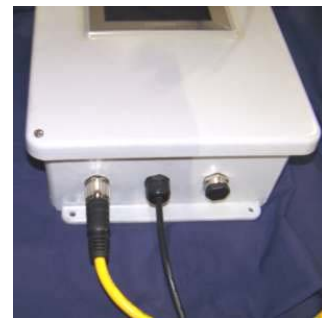
24Vdc Pos. (+)

The Tank Switcher can trigger an external device such as an auto dialer or alarm. This connector (far right in the photo) requires a 2-pole plug available from Technifab. The Tank Switcher sends a 24 volt DC signal when all tanks have been depleted.