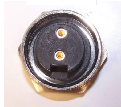
24Vdc Neg. (-)

The pin closest to the notch in the connector is the ground and the positive terminal is furthest away (see photo). Refer to the specifications section for electrical signal specifications.