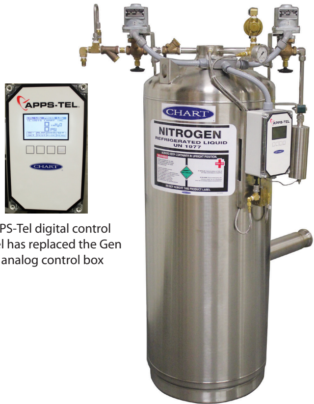
APPS-Tel digital control panel has replaced the Gen 3 analog control box